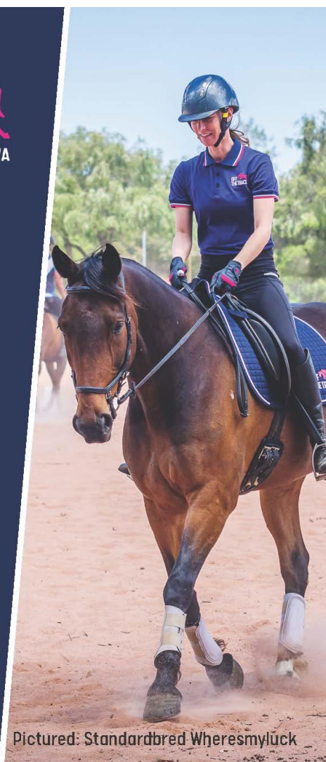
Pictured: Standardbred Wheresmyluck